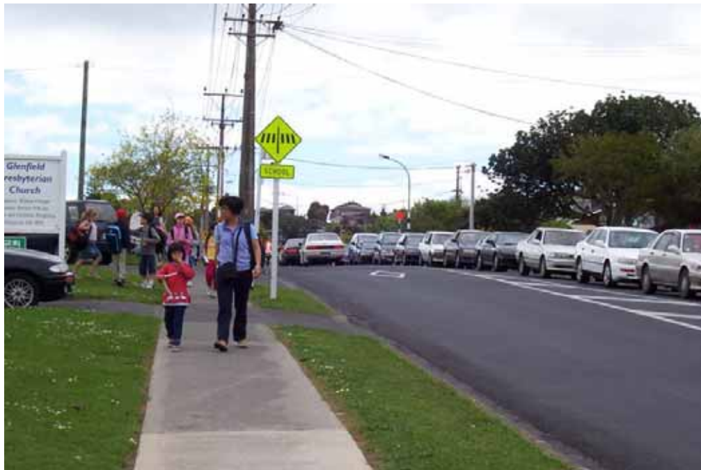
Afternoon traffic on Chivalry Road