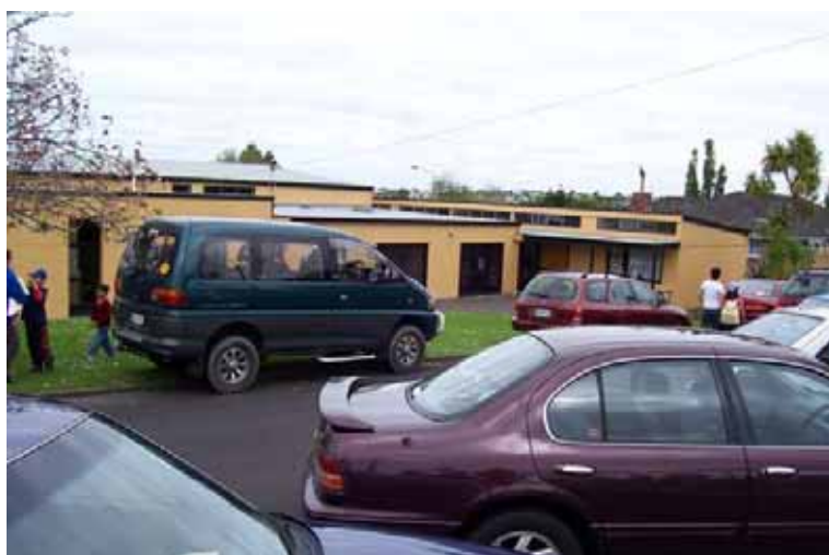
Safety issues in the Church car park.