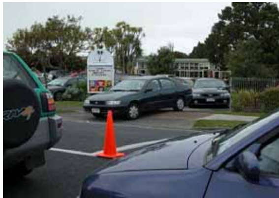
A car turning right from the staff car park